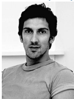
Royal Opera House